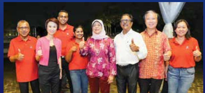
SGS Co-Op Committee Members with President Halimah Yacob and Ms Low Yen Ling, Mayor of the South West District

The lights festival was held from 25 Aug to 18 Sep, attracting around 800,000 visitors and raised around $300,000 for the President's Challenge Charity Fund. This event was presented by the National Parks Board, in partnership with A-Smart Media, People's Association and the South West Community Development Council, and supported by the National Arts Council and SPH Media's Chinese Media Group.