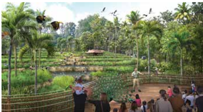
Artists' illustration of the lower pavilion of Wings of Asia, an aviary inspired by the rice fields and bamboo groves of Southeast Asia.