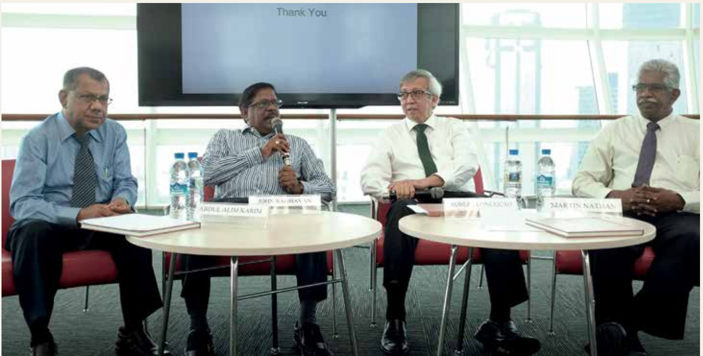
Sharing our history and heritage at a public forum in April 2016.