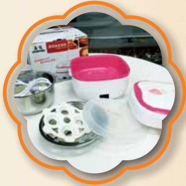
Multi-purpose mini rice cooker & steamer worth $50!