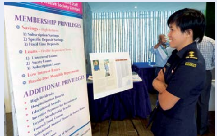
Roadshows, like the one held at Singapore Civil Defence Force in October 2016 (pictured), are an effective way to drive membership.

Through membership roadshows and sharing sessions, the Co-op hopes to raise awareness of SGSCC among more public service officers.