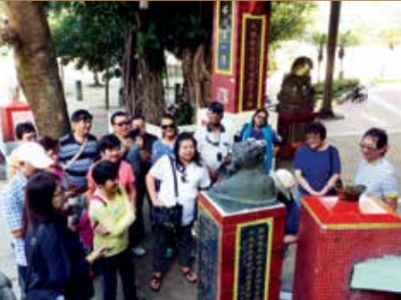
HONG KONG TOUR