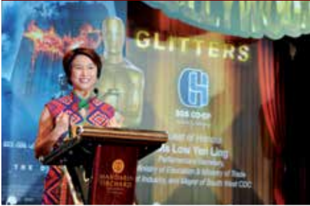
91ST ANNIVERSARY GALA DINNER